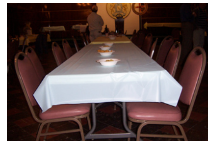
There were plenty of empty chairs

us, please have a safe and joyful summer, see you at the club!